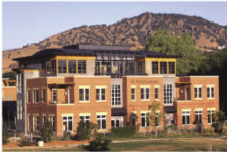
The Nature Conservancy, Boulder

The Mesa Silent Auction will be held at The Nature Conservancy (Spruce and Folsom in Boulder) on Saturday evening, March 11, from 6:30 – 9:30 PM. We are very thankful to The Nature Conservancy for allowing us to use their beautifully designed and decorated space. We hope you can join us for an enjoyable evening full of great deals, food and company!