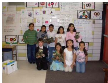
Third Grade students smile big with their wildcats!

Congratulations to our students with positive values and their families.