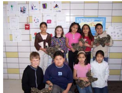
Third Grade thinkers smile big with their wildcats!

Congratulations to our thinkers and their families.