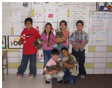
Second grade students smile big with their wildcats!

Congratulations to our students who are committed to learning and their families.