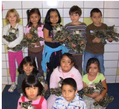
1st grade recipients