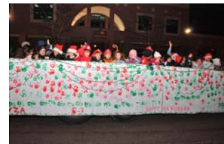
Lights of December Float

Next Meeting—Monday, January 12th 6:30 PM in the art room, childcare, snacks and translation provided.