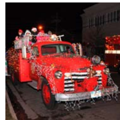
Lights of December Float

quent years. PTA voted to try this approach. Setting up a room parent network is in progress and we hope to have a system in place soon. Teachers were encourage to shift their thinking towards asking for volunteers more. PTA heard about the new "Take Art Home" program. Our art teacher will be teaching some afterschool classes in the winter and spring. Students participating in the classes will have a way to practice their art skills at home. Parents made some suggestions for next year's carnival.