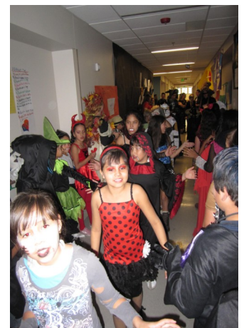
We had a BLAST on Halloween