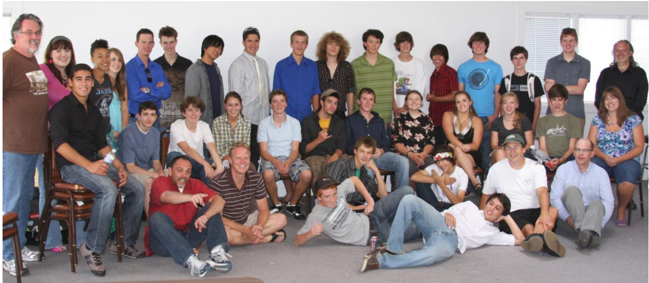
(Westcliffe Pictures courtesy of Jan Pyle)